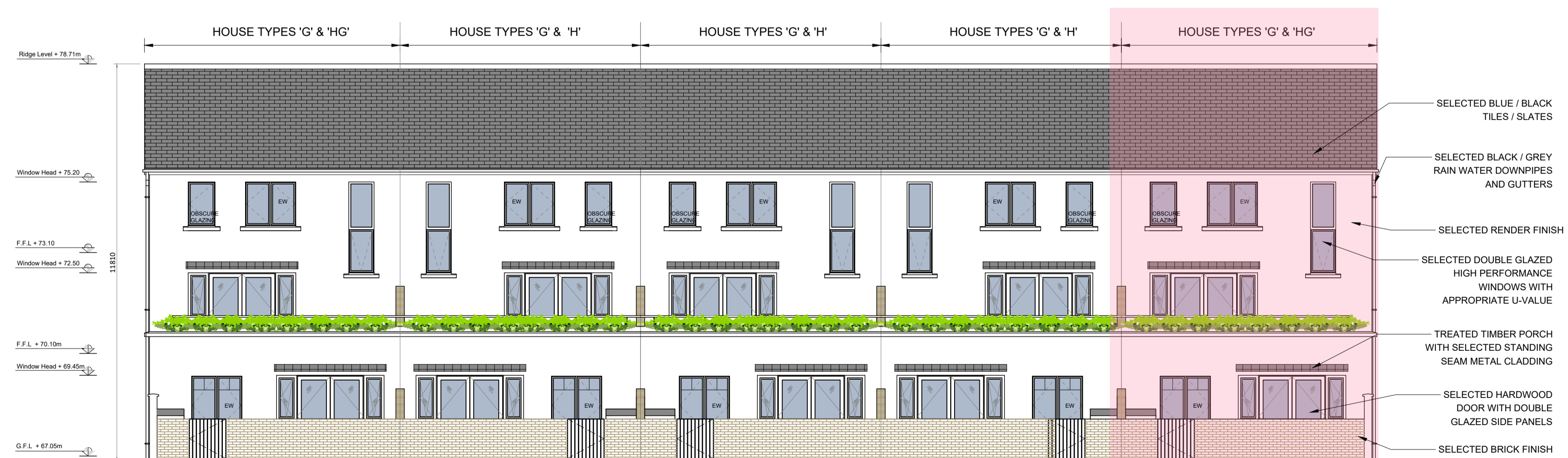
WEST ELEVATION - BLOCK G